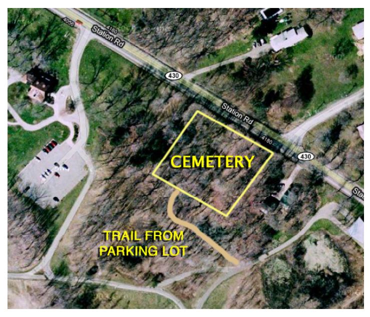
Aerial View of Cemetery in 2011 Google Earth Image

Bottom left outline is a detail of the smaller yellow block next to the road.