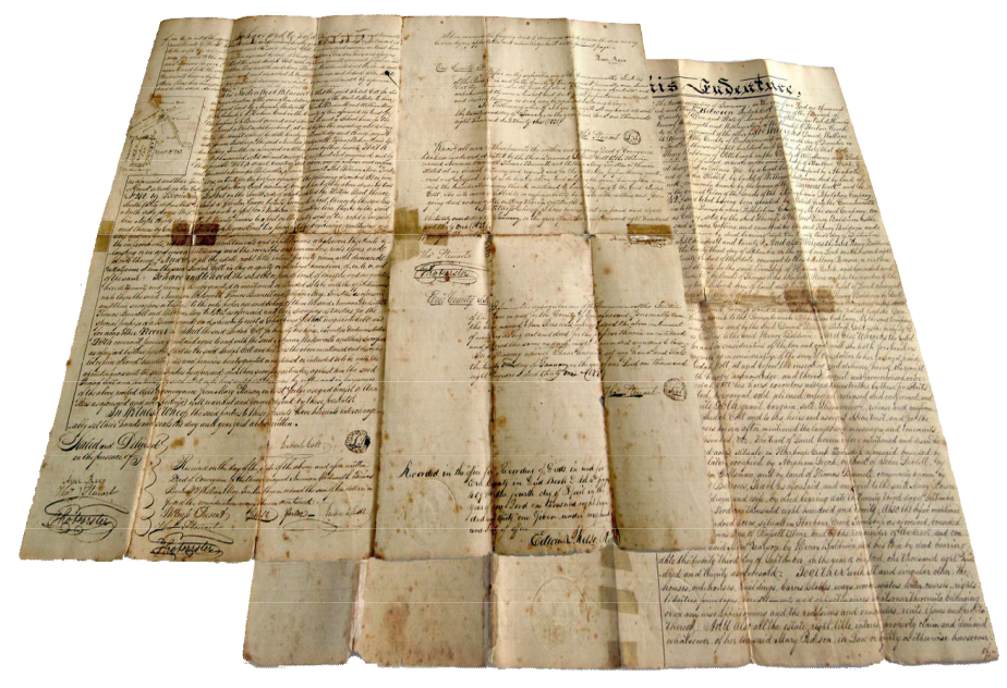
Photo of 1831 Deed and Indenture in 2010 (Inside and outside views)